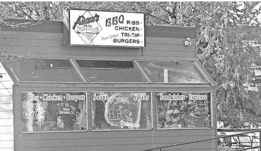
Adam's Rib Steakhouse, located at 1210 State St., scored a perfect 100 in its semi-annual restaurant inspection Feb. 18.

Semi-annual restaurant inspections from Jan. 29 to Feb. 21.