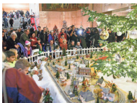
Holidays at the Capitol comes to the Oregon State Capitol from Dec. 4 to 24.

Curiously Wonderful Christmas Stories: An evening of storytelling and Christmas cheer that celebrates holiday traditions from around the world, 7 p.m. Dec. 13, 14, 19 and 20, 2 p.m. Dec. 14 and 15, Theatre at the M. Lee Pelton Playhouse, Willamette University, 900 State St., Salem. $12-$15. www.theatre33.org or 971-599-1029.