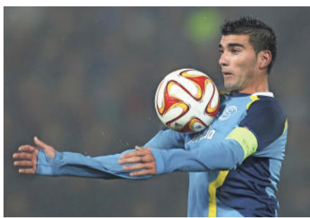
Former Spain midfielder Jose Antonio Reyes was killed in a traffic accident at the age of 35, Sevilla said in a statement Saturday. He won five Europa League titles and was part of Arsenal's unbeaten "Invincibles" squad.

Reyes' former Arsenal teammate Thierry Henry also said he was "devas-