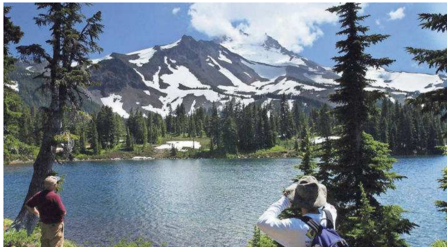
Hikers look out at Mt. Jefferson on Scout Lake in the Jefferson Park Wilderness.

"Requiring a fee-based permit system puts wilderness out of reach of low-income individuals," wrote Holly Scott