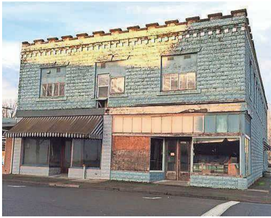
The Dietrich Building in downtown Stayton before its recent remodel.

request to Oregon Main Street by the March 8 deadline.