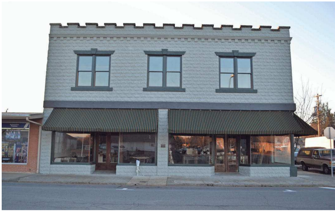
What the Dietrich Building in downtown Stayton looks like since it was remodeled.

The final design will be completed Feb. 15 so the group can submit its grant