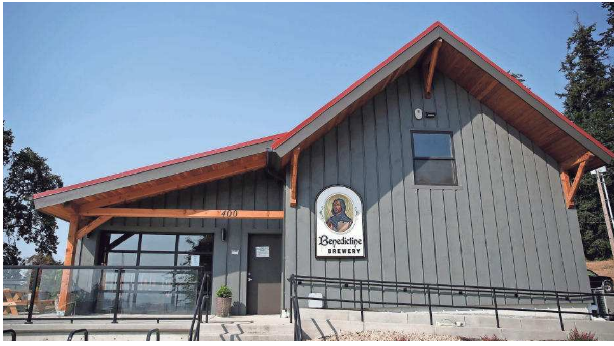
The Benedictine Brewery in Mt. Angel, shown on Sept. 5. The brewery, operated by the monks of Mount Angel Abbey, opened Sept. 22.