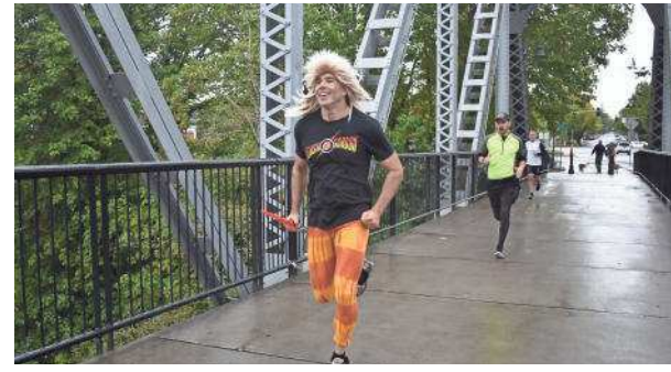
A runner dashes across the bridge during the first leg of the River 2 Ridge Relay.