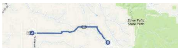
A section of Highway 214 between Highway 22 and Silver Falls State Park will see paving work in July.

The work will add a two-inch overlay of asphalt, striping and material to the road's shoulder. It will