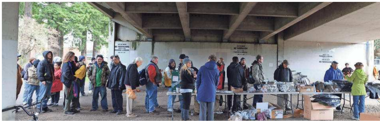
A network of advocates and nonprofits, with help from an army of volunteers, will conduct a homeless count for Marion and Polk counties.

Last year, 1,151 homeless people were counted.