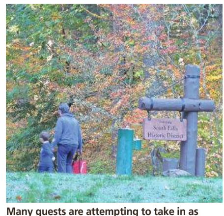
Many guests are attempting to take in as much of Silver Creek Canyon as they can before the cold weather rolls in.