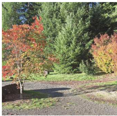
Visitation to the park has seen an increase recently thanks to the warm weather.