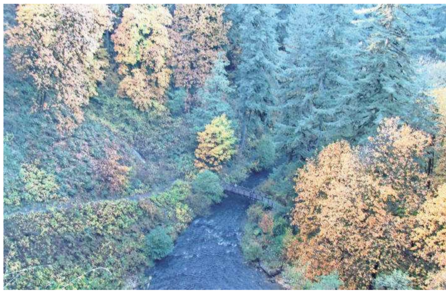
Silver Creek Canyon proves popular year-round, but the changing colors of the leaves draw in a large number of guests this time of year.

The vibrant look opened a window for those given to enjoy the park, possibly a final view before rain and wind move in for the winter season.