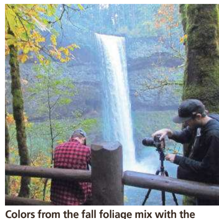
Colors from the fall foliage mix with the peaceful cascade of the waterfall at Silver Falls.