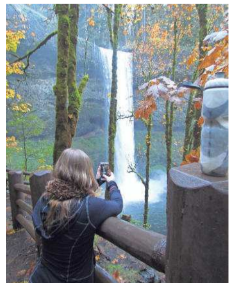
Silver Falls is where you will often find photographers of all experience levels attempting to grab a photo of the falls.