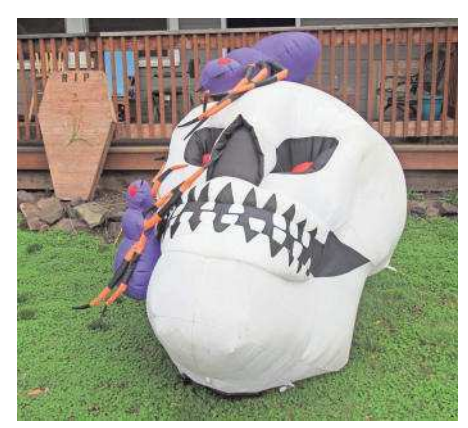
Many icons of autumn and Halloween are popping up around Silverton.