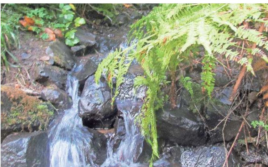
While exploring the forest, visitors may find themselves greeted by a flowing waterfall, left, or a moss-covered tree, right.