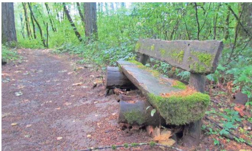
Don't worry hikers, even though there's a little moss, this bench is still a great place to sit and catch your breath during your journey.

Sunlight, water and air. • It doesn't get any simpler than that. • A crisp autumn bout of exercise joined with a refresher science course at Peavy Arboretum in the McDonald State Forest. • The brief Woodland Trail placard imparts: "Plants use carbon dioxide from the air, water from the soil and energy from the sun to produce food. During this process, the plant's leaves release oxygen into the air making it available to you and the forest animals." • Uprooted trees, fall debris, fungi, insects and earthworms all make their way into the hiking lesson, as do skunks, deer and other myriad forest denizen dwellers. • All tucked into one of the Willamette Valley's gems.