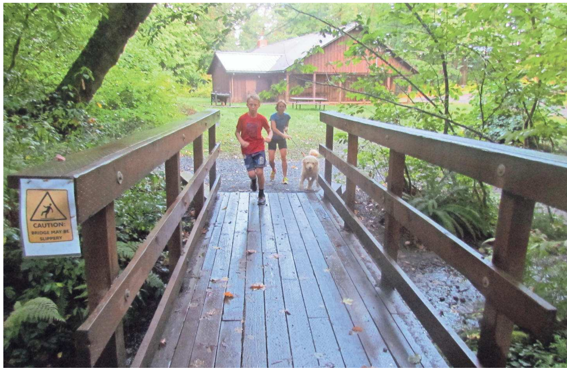
McDonald State Forest is a wonderful gem that serves relaxation, recreation and research alike.

Sunlight, water and air. • It doesn't get any simpler than that. • A crisp autumn bout of exercise joined with a refresher science course at Peavy Arboretum in the McDonald State Forest. • The brief Woodland Trail placard imparts: "Plants use carbon dioxide from the air, water from the soil and energy from the sun to produce food. During this process, the plant's leaves release oxygen into the air making it available to you and the forest animals." • Uprooted trees, fall debris, fungi, insects and earthworms all make their way into the hiking lesson, as do skunks, deer and other myriad forest denizen dwellers. • All tucked into one of the Willamette Valley's gems.