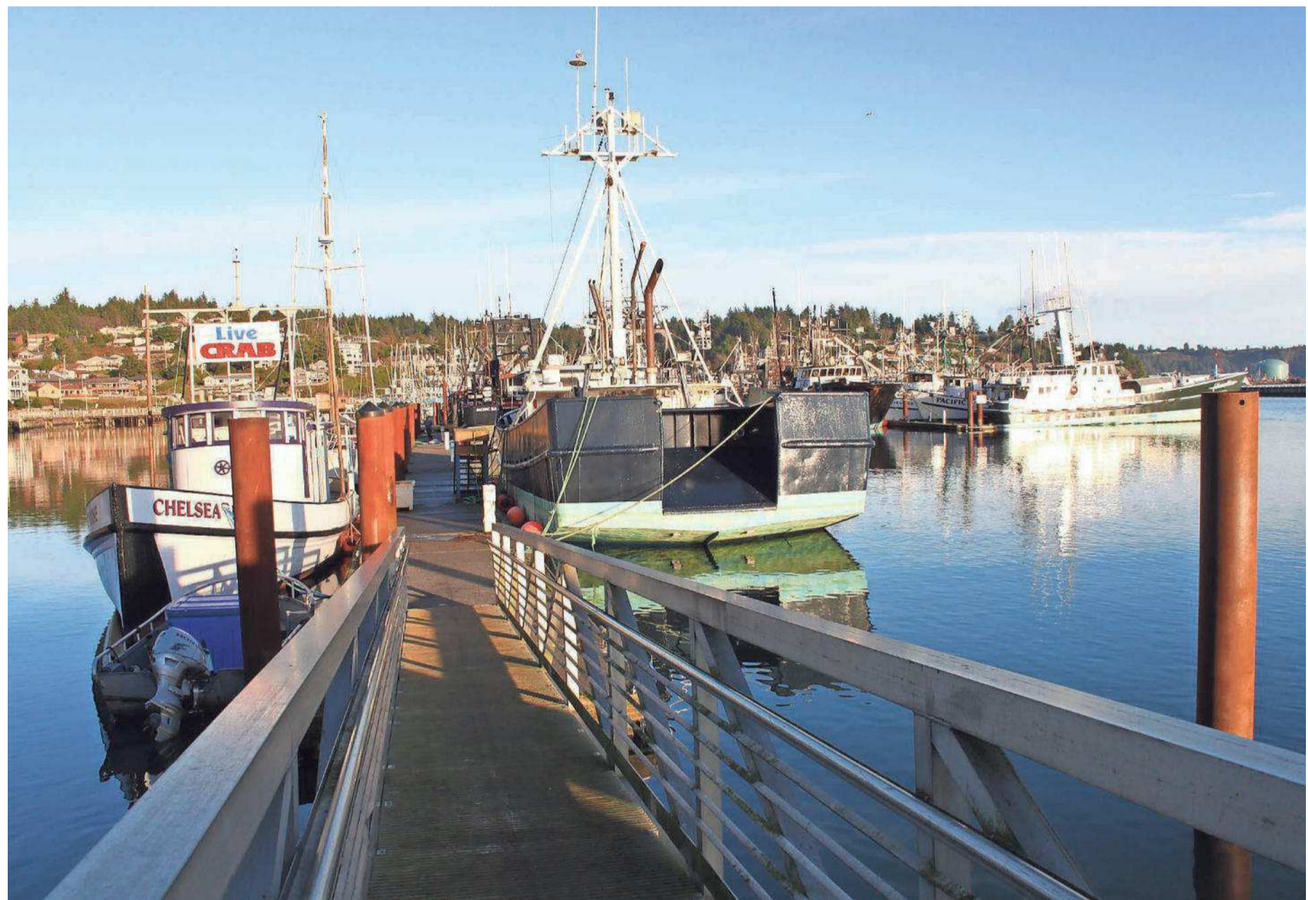
Boats, including a crabbing boat, is docked at the Newport Bayfront.