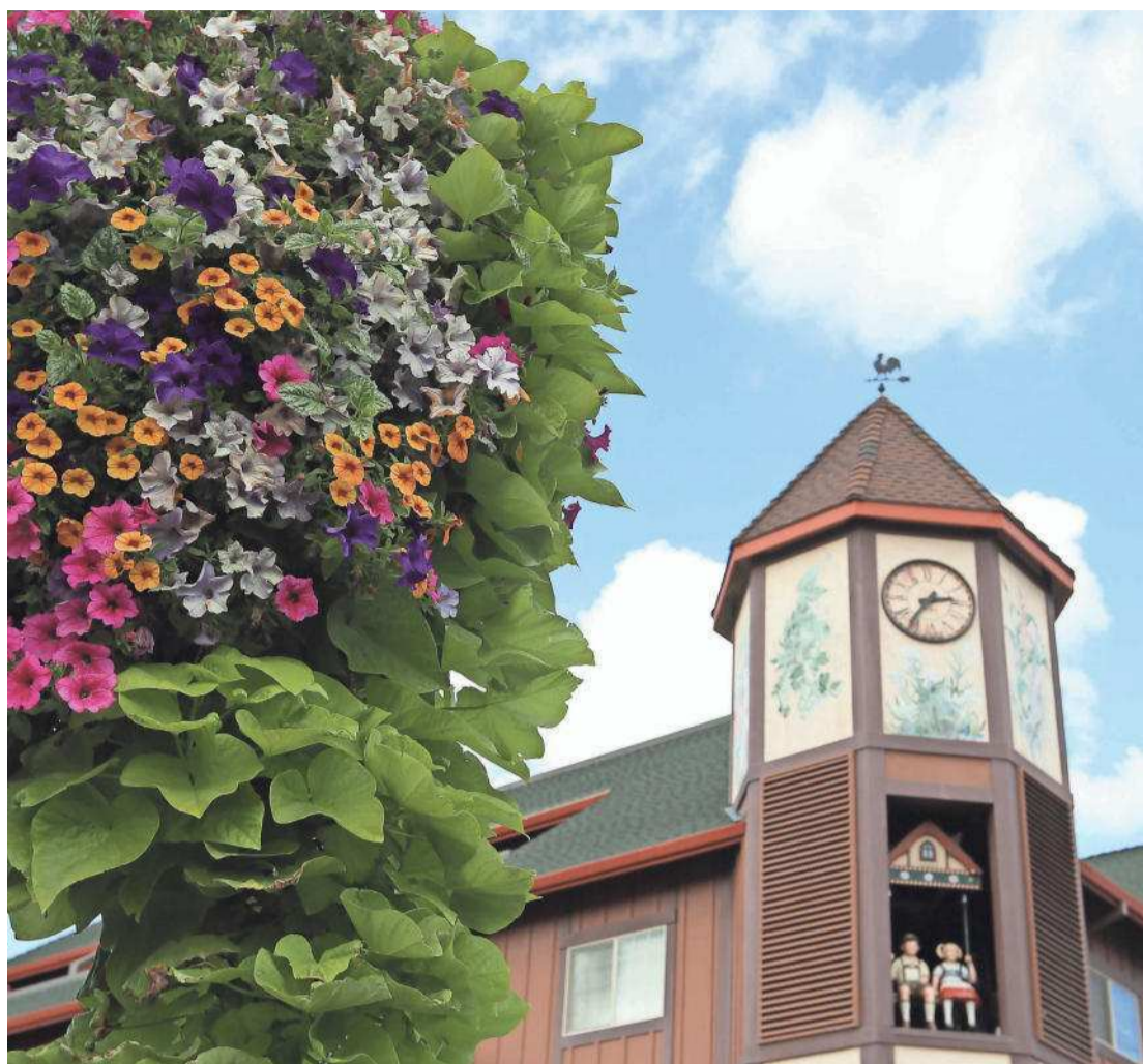
The glockenspiel can be appreciated year-round, not just during the Mount Angel Oktoberfest celebration each September.