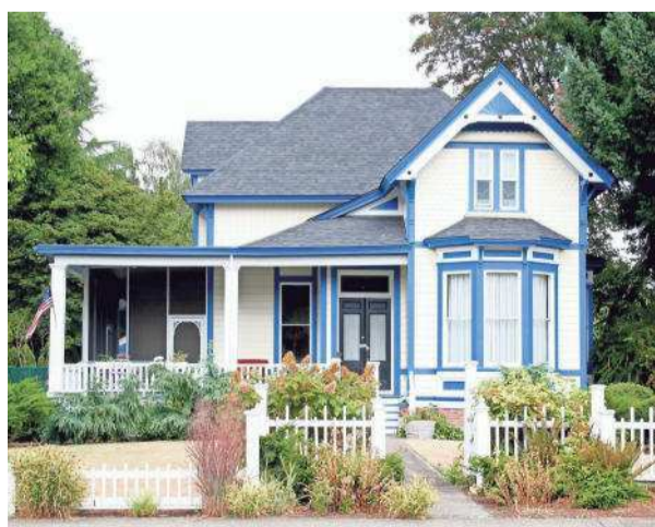
The McClaine House.

"We want to serve and be an asset to the commu-