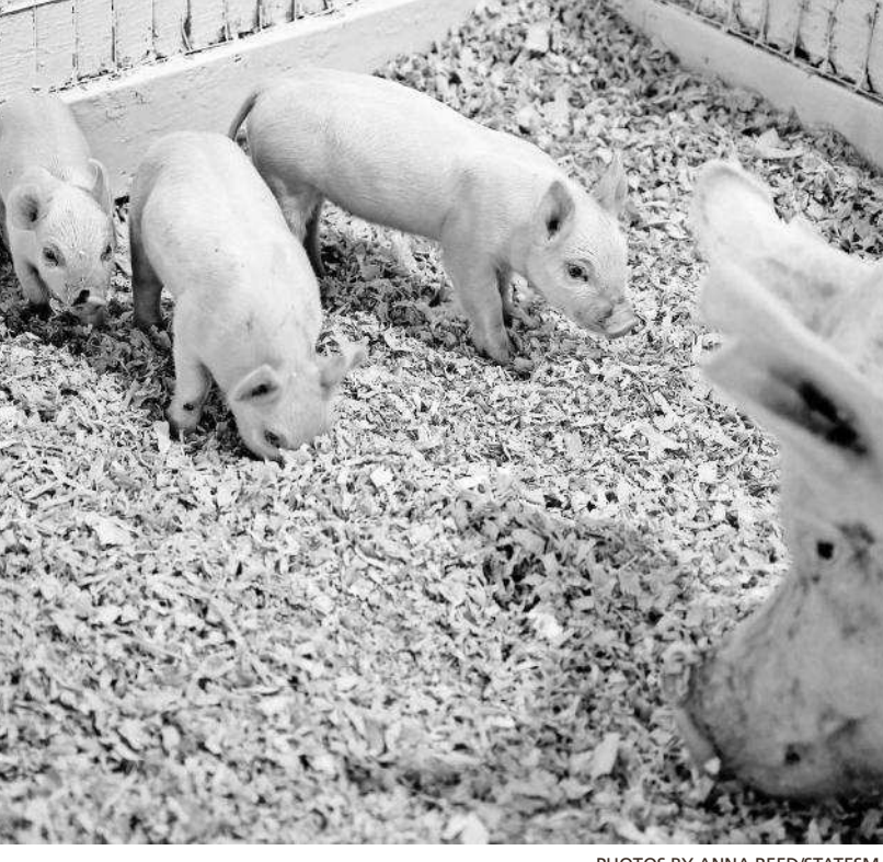
A sow and her piglets will be on display every day of the Oregon State Fair.

That was probably the number one asked ques-