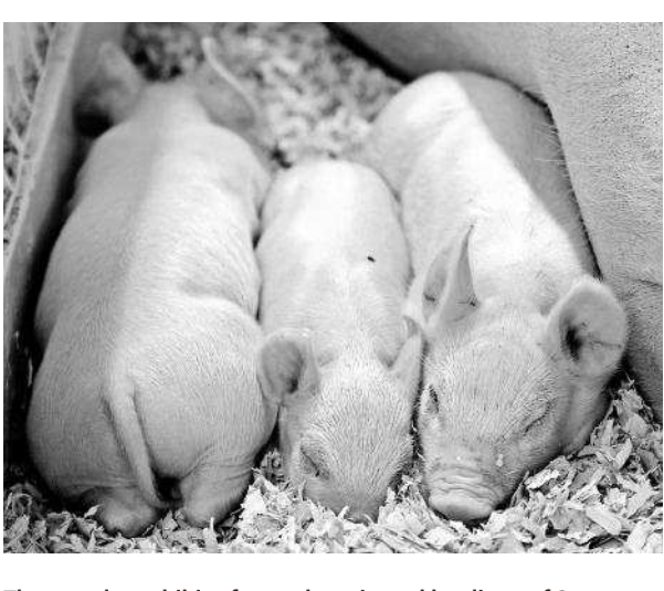
The popular exhibit of a mother pig and her litter of 2- to 3-week-old piglets was last seen at the fairgrounds in 2013.

look forward to.' The popular exhibit of a mother pig and her litter of 2- to 3-week-old piglets was last seen at the fairgrounds in 2013. The absence was triggered by nationwide concern about PEDV (porcine epidemic diarrhea virus), which can be particularly harmful to young pigs, Forcier said. Rather than risk an epidemic, fairs across the country suspended most