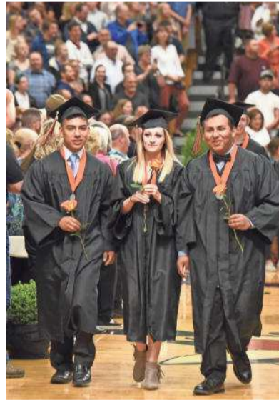
Graduates make their entrance during the commencement ceremony.

For a complete list of Silverton High School graduates, see page 3A.