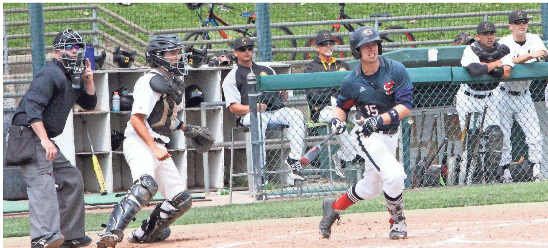
The Chabot College bench watches during Green's at-bat during a game on April 22. The shortstop is hitting .354 with seven home runs and 42 RBI in 39 games this season for College of San Mateo.

bpoebler@StatesmanJournal.com or Twitter.com/bpoebler