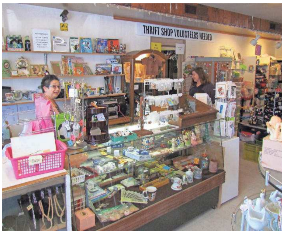
Proceeds from the Silvertown Seniors Thrift Shop help the Silvertown Senior Center.

That's one thing that's changed as the grand prize now fetches $750, followed by a $500 first prize, $300 second and $200 third. There will also be a people's choice awards.