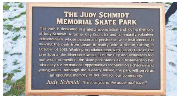
A plaque at the skate park.