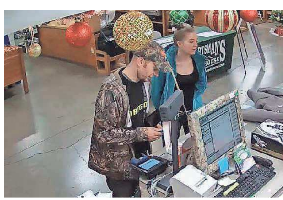
State police are looking for a man and woman suspected of stealing more than $10,000 in items from cars at Silver Falls.

Email wmwoodwort@statesmanjournal.com, call 503-399-6884 or follow on Twitter @wmwoodworth