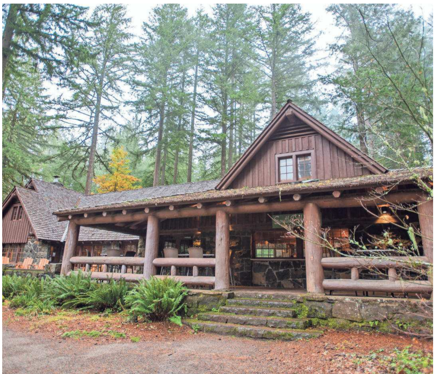
A bit of fall color still remains around the South Falls Lodge at Silver Falls State Park.

Contact: For more information call 503-873-8681 or visit OregonStateParks.org .