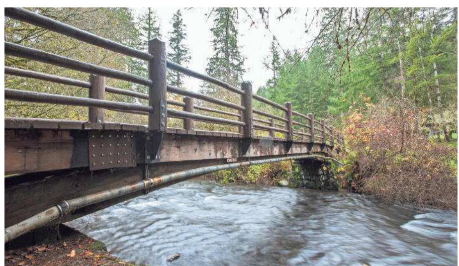
A rustic bridge crosses Silver Creek along a paved path leading to the South Falls overlook at Silver Falls State Park.