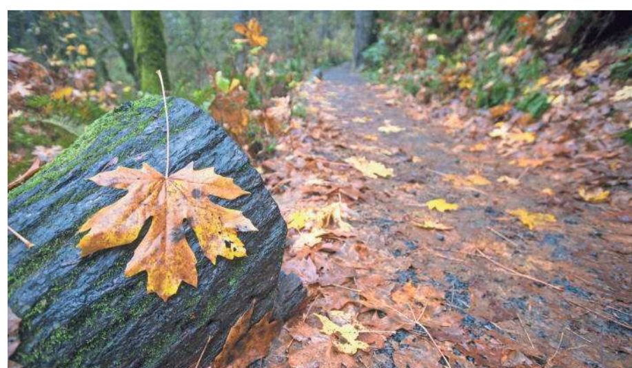
Orange and yellow leaves cover the trail leading to the South Falls at Silver Falls State Park.