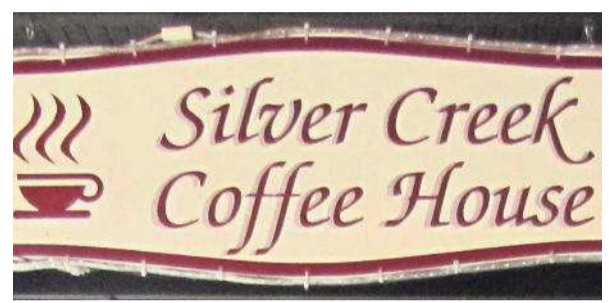
Silver Creek Coffee House on Water Street is the site for Creekside Chat each first and third Wednesday.