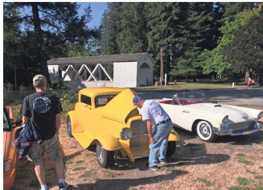
Cruise-in car show in Pioneer Park, is part of the 21st Annual Santiam SummerFest in Stayton.