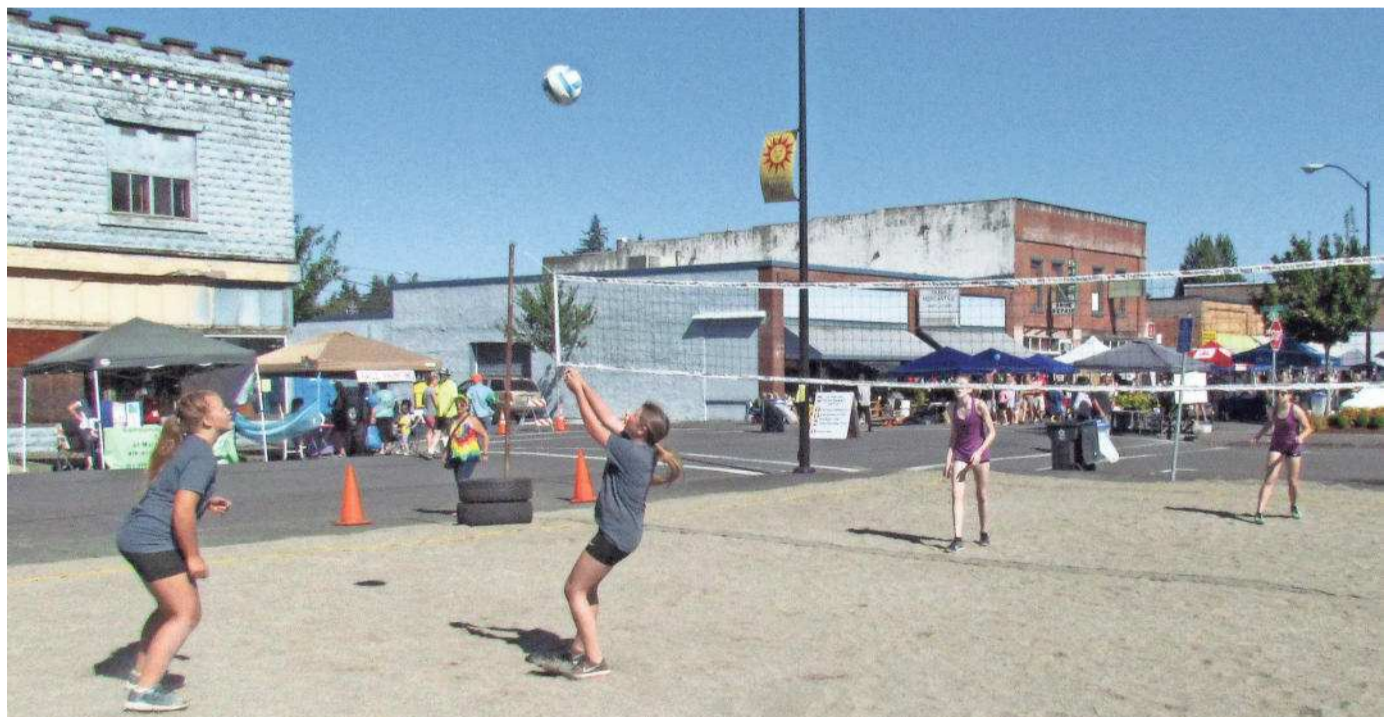
People play uptown beach volleyball in downtown Stayton.

Images from the 21st Annual Santiam SummerFest held July 30, 2016.