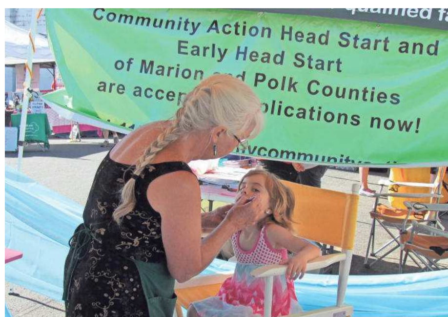
A child gets her face painted at a booth on July 30.