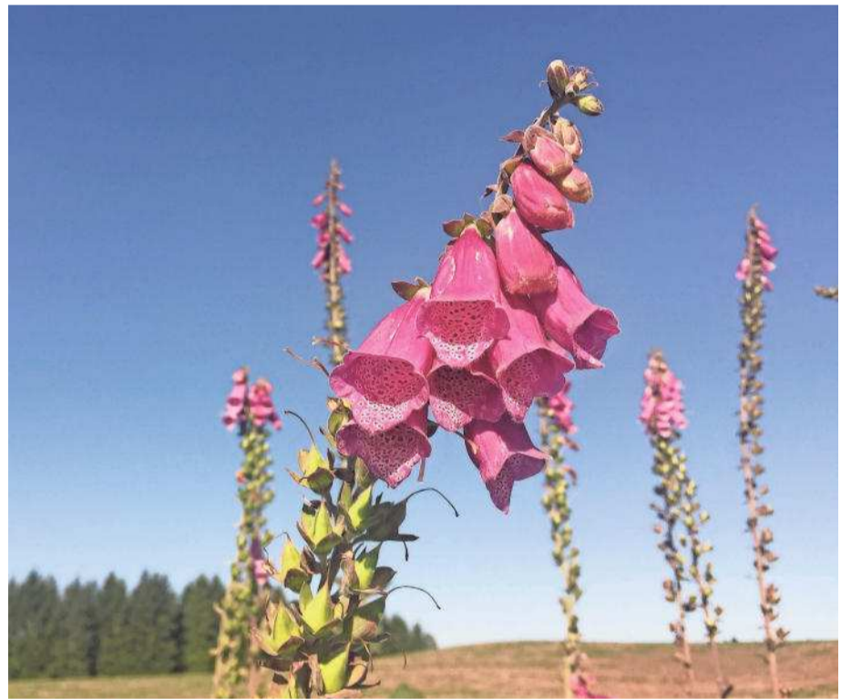
Summer's first week in the foothills proved favorable to foxglove.