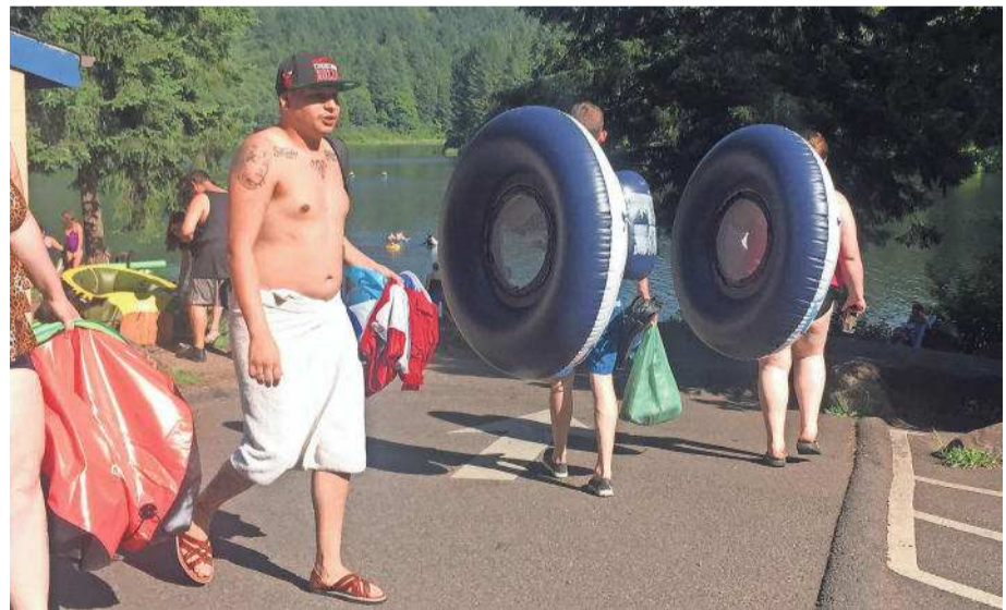
Silverton area's Silver Creek Reservoir saw popularity rise with the temperatures during the first week of summer 2016.