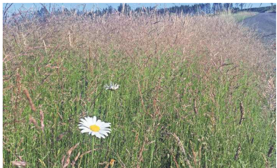
Roadsides beard up with bent grass, fescue and other varieties of verdant volunteers during summer's first week in the foothills.