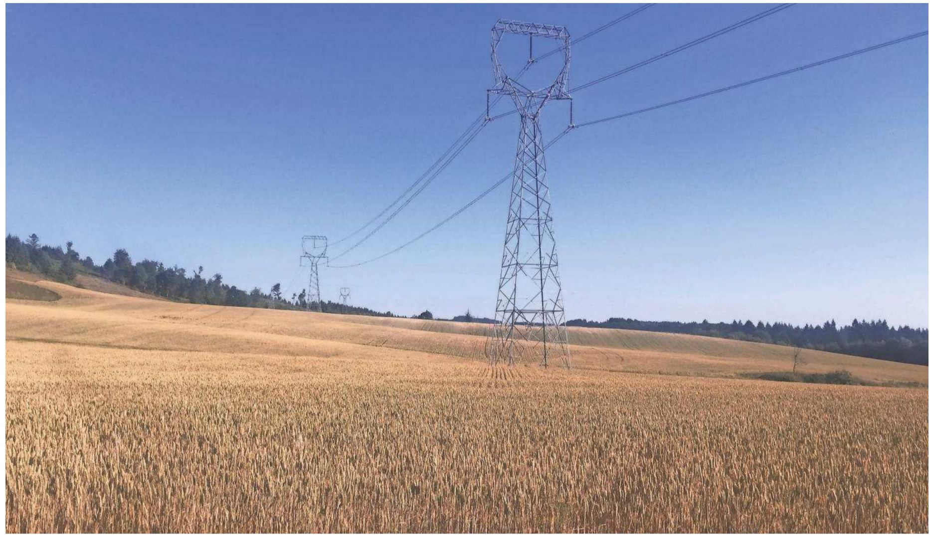
Power lines pull through wheat field going toward golden during summer's first week in the foothills.