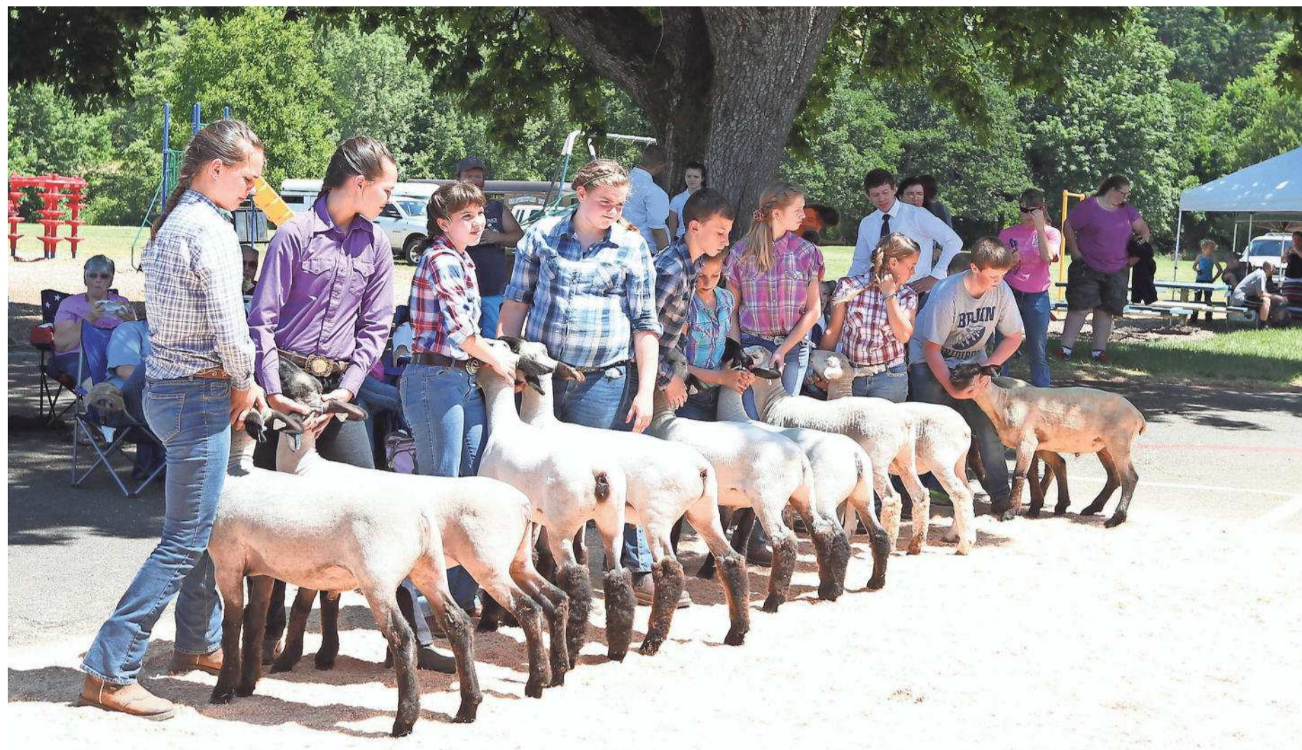
Participants line up their sheep during a class at the 79th Annual Marion County Lamb & Wool Show on Saturday in Turner.