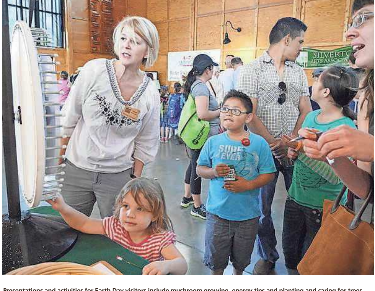
Presentations and activities for Earth Day visitors include mushroom growing, energy tips and planting and caring for trees.

the Earth as a whole, the day's activities will intree-planting clude a demonstration, guided tours with Master Gardeners who will also be available to answer gardening questions, a number of various themed gardens to enjoy and plenty of activities for