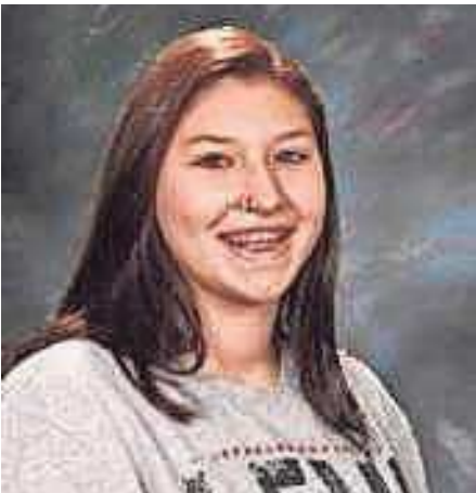
SPECIAL TO THE STATESMAN JOURNAL