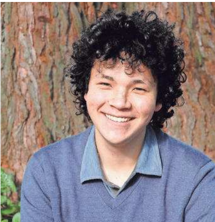
SPECIAL TO THE STATESMAN JOURNAL