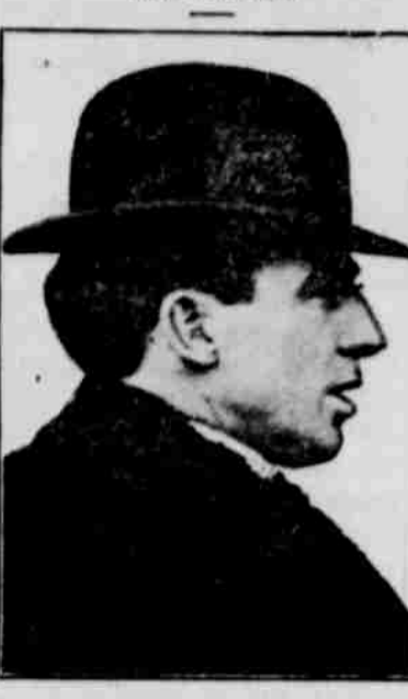
Newly Signed Manager of the Cincinnati Reds.