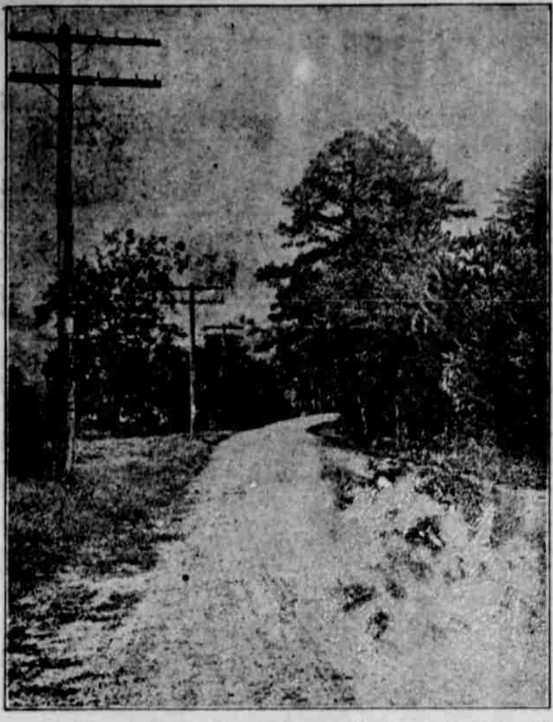
The illustration given herewith shows a "Tony Tank Road" in Wi comic county, Mich. It was built by the penetration method, with crush ed stone and "U. G. I. Binder."