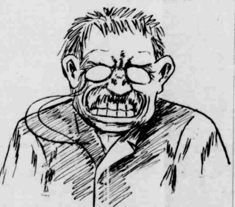
THE MORNING AFTER