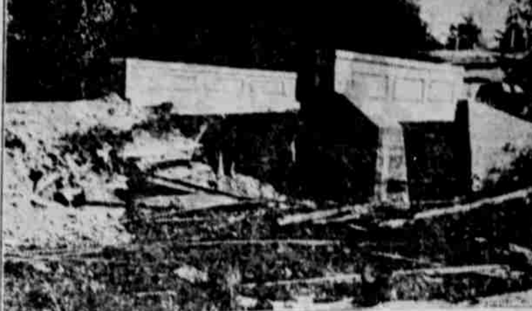
The illustration given above shows a 33-foot reinforced concrete bridge built for $1,350 in Polk county, Wisconsin, under plans of the highway division.