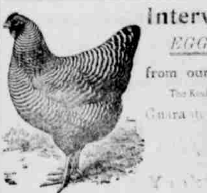
B. PLYMOUTH ROCK

Her Change. "Husband, you look lovely today, certainly. Is that what you are BY WHOLE? No, I don't see what you've had for lunch today."—Herald.