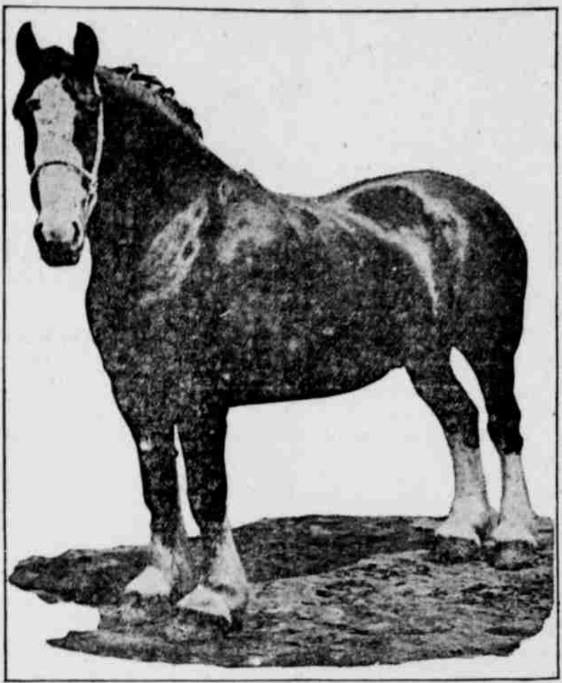
One of Clydesdale Geldings That Bring High Prices for Six-Horse Team.

No Mechanical Contrivance or Motor Vehicle Has Yet Been Discovered to Replace This Magnificent Animal—Most Valuable Asset the Farmer Has Who Breeds Him Properly.