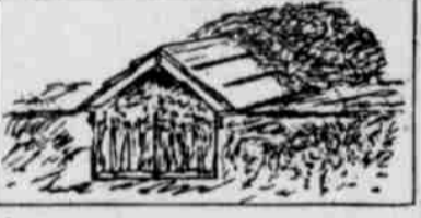
Storage Trench for Celery.

FOR ALL EYE PAINS Pettits Eye Salve Stranger—Have you a good hair tonic you can recommend? Druggist (in prohibition town)—Here is something that is spoken of very favorably by people who have drunk it.—Puck.