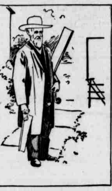
A Typical Shaker.

New York.—The Shakers are a body of seceders from the Society of Friends formed by Ann Lee (Mother Ann) of Manchester, England, about 1757, and so called from the wild and violent contortions introduced by them into their form of worship. Their official title is "The United Society of Believers in Christ's Second Appearing." The sect emigrated to America in 1772 and settled near Albany in 1774. Their chief seats have been at Mount Lebanon and Water-