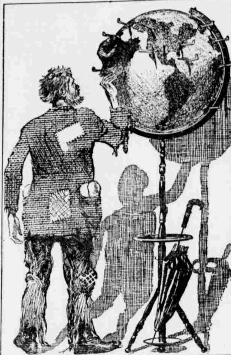
"Any old place, I hang my hat, If 'Home, Sweet Home' to me."

W HAT is a "gay cat"? Perhaps you have never heard of him, though you know tom cats, wild cats and feminine "cats." He is an intriguing combination, and his species is numbered by thousands. He is half tramp, availing himself of all the hobo's expedients for gadding about the world without paying for his travels, and half man with a trade, the goal of whose rambles is always a job. He has all the "bum's" philosophical contempt for the man so "easy" as to "ride the velvet," which means to pay railroad fare. But he also incurs the "bum's" astonished disdain because of his incorrigible habit of looking for work.