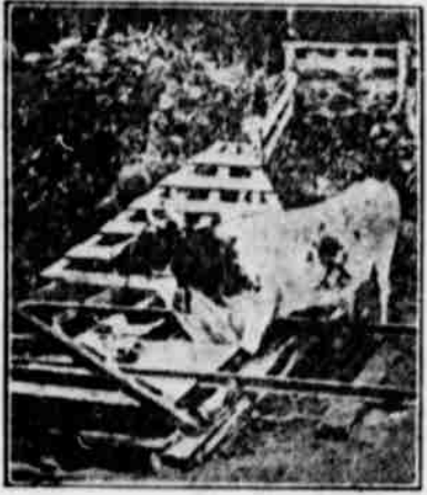
Novel Cattle Guard.

Chicago.—The old story about some one asking George Stephenson, the inventor of the locomotive, what would happen to a train if a cow wandered on the line, to which the latter replied he would "be very sorry for the cow," seems to have found a sympathetic echo in the western states in the form of a novel cattle guard on railways, the practical utility of which is demonstrated in the illustration. The device claims to effectually prevent cattle straying up the railway line and thus meeting with injury or death from oncoming trains. As the cow walks along the track she meets