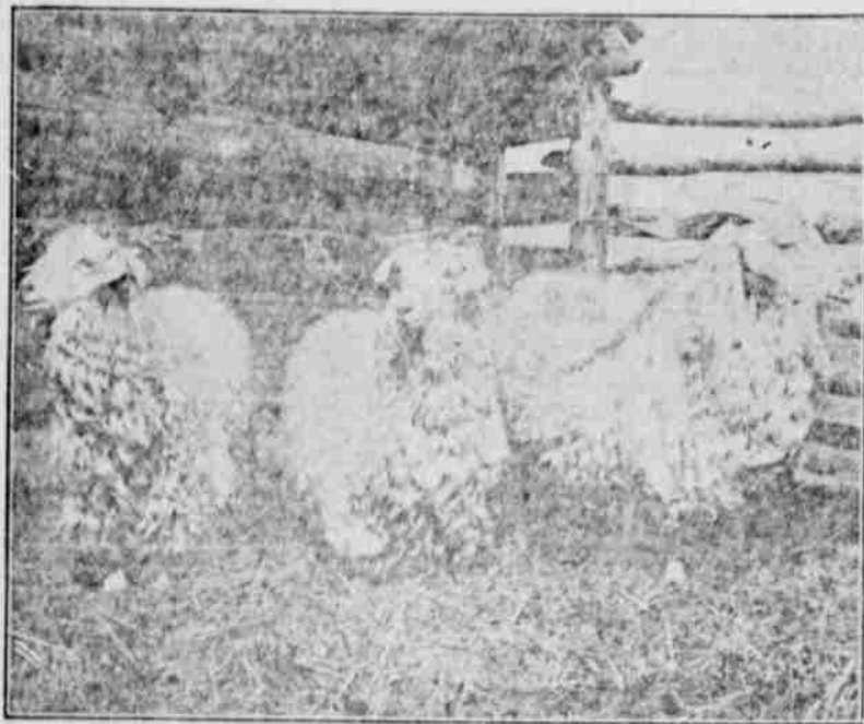
Angora Goat and Does.

One Animal to Acre Will Keep Briars, Weeds and Bushes Completely Subdued on Land That is Inclined to Grow Up in Wood.