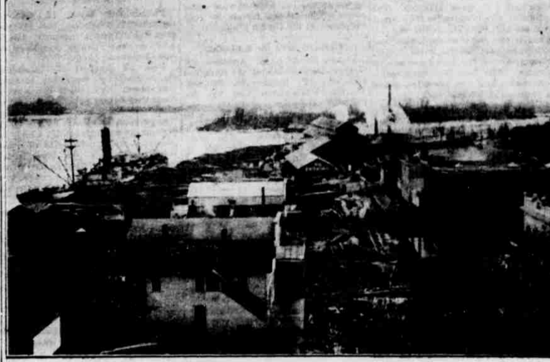
LOOKING SOUTH FROM THE COURTHOUSE