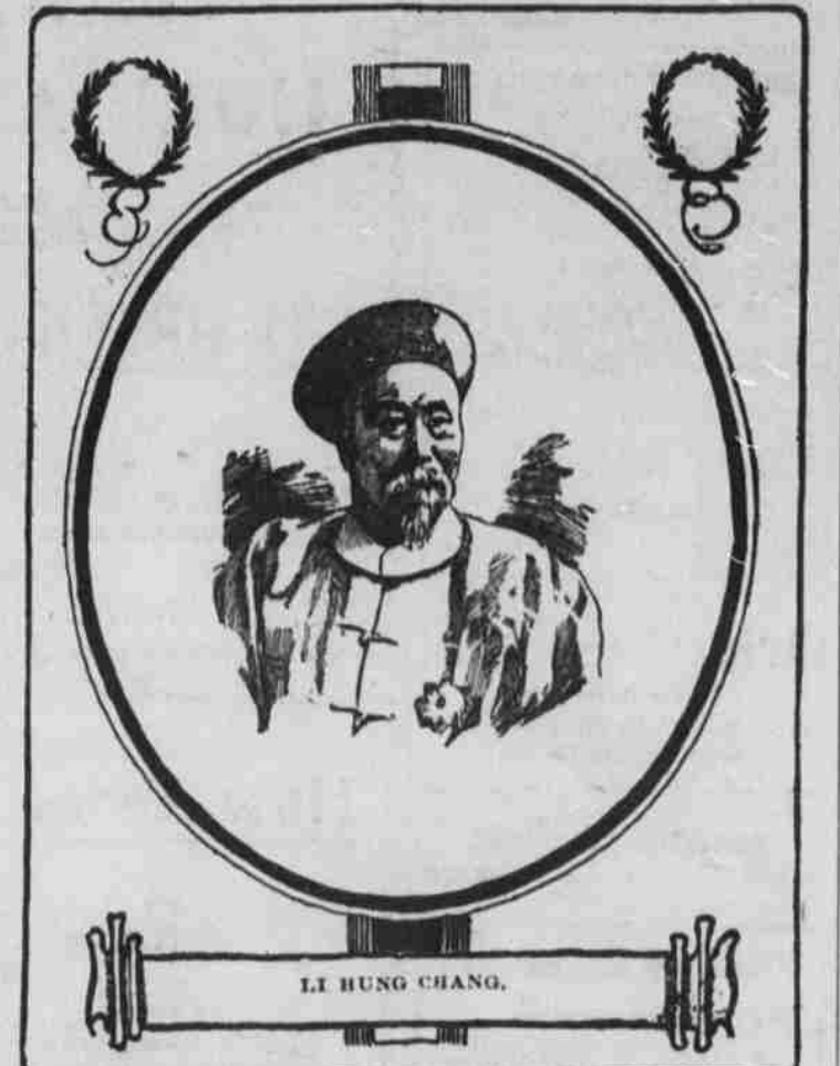
LI HUNG CHANG.

He went immediately to the region where, according to report, the codex was found, sought out the shrewd Mex-