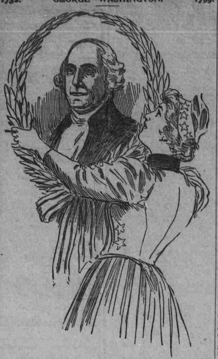
George Washington, the first President of the United States, was born on Bridge Creek, Westmoreland County, Va., Feb. 22, 1732, and died at Mount Vernon, Dec. 14, 1799.