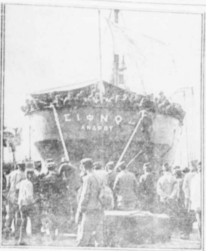
This photo, taken just before the occupation of Smyrna by the victorious Kemalist army, and breaking out of the disastrous fire which practically leveled this important commercial town to the ground, shows remnants of the shattered Greek army and post-striken refugees crowding the wharf, awaiting transportation back to the homeland.