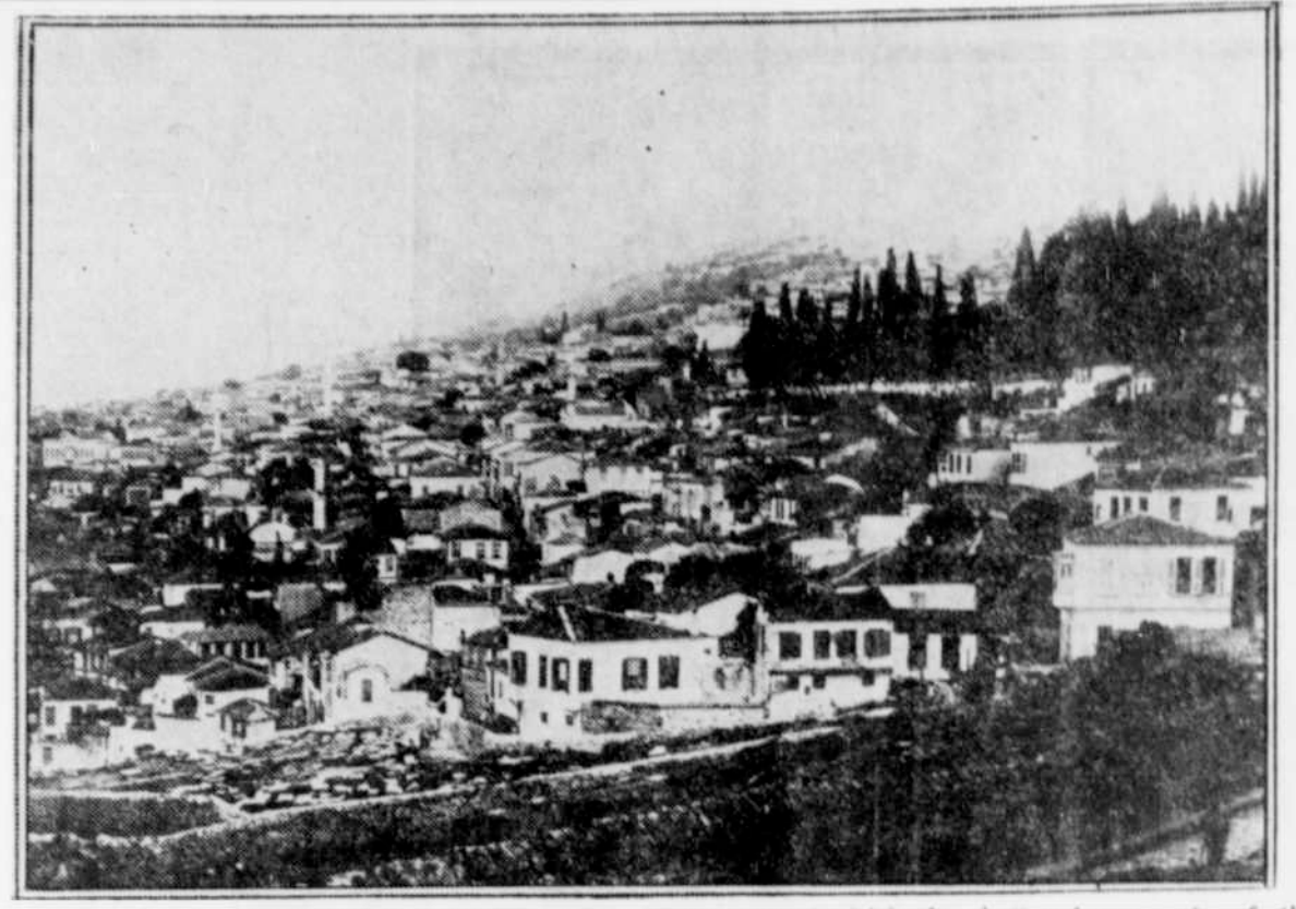
A photo of Smyrna, center of Greek control in Asia Minor, toward which the shattered remnants of the Greek army now are retreating as rapidly as possible, hotly pursued by the Nationalist Turks under Mustapha Kemal Pasha. Its capture by the Turks is now highly probable.