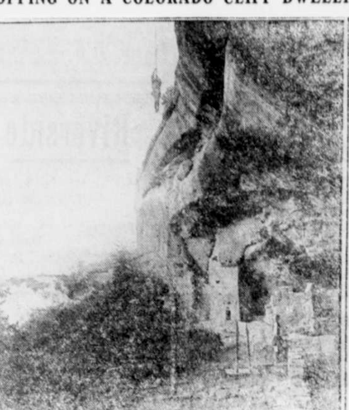
Dropping in is literal as well as figurative when you go calling in the ancient dwellings of the prehistoric diff dwellers. It takes a hardy adventurer to go calling in that part of the Mesa Verde National Park of Colorado

The training supervisors of the northwest district also recommend that war veterans carry on diversi-