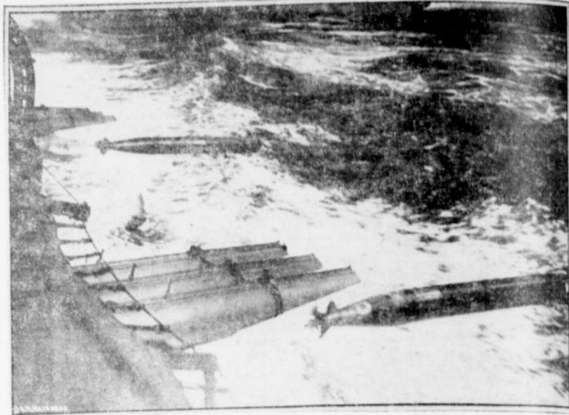
An exclusive photograph taken aboard the U. S. S. Scudder as the man-of-war was firing torpedoes through a dense smoke screen against the battleships of the Pacific fleet at a distance of eight miles. The target could not be seen by the attacking ship. Photo shows: The two torpedoes just as they left the tubes on their long trip through the white caps.

again until a penalty of $1 has been paid.