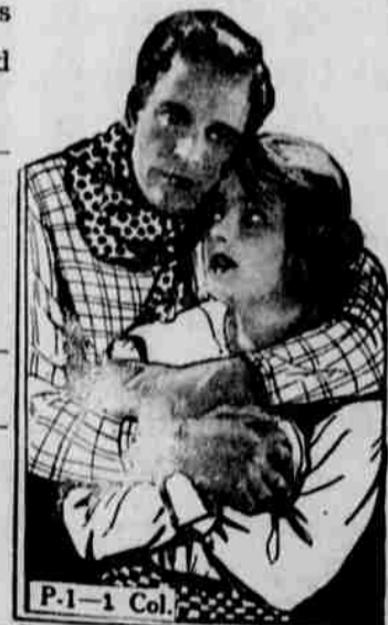
THE BRANDING IRON A Reginald Barker Production GOLDWYN