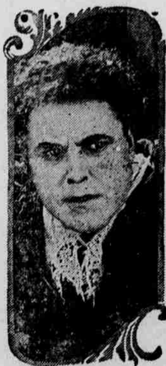
WILLIAM FARNUM DIRECTION WILLIAM FOX