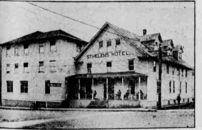
European Plan—American Plan. Everything Modern at the George, Prop. ST. HELENS HOTEL. Rates $1.00 and Up. Busses Call at Hotel. Special Rates to Regular Boarders