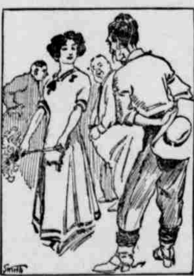
quired the Foreman.

have a previous engagement. I see! Jove! It's quite dramatic. But I don't