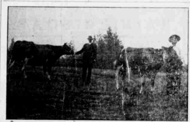
TWO OF THE IMPORTED GUERNSEYS,