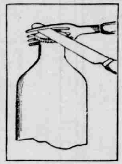
Metal Top Remover.

Everybody is familiar with the little metal tops used on bottles. But specially designed opener. A Phila-