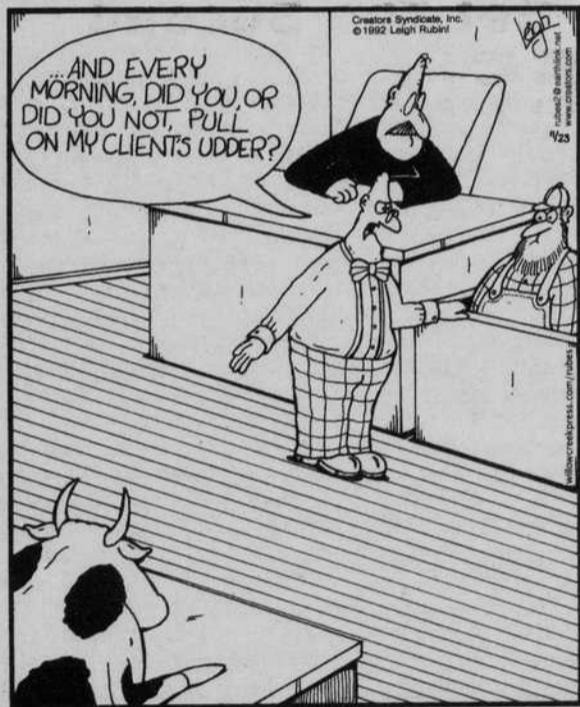
The sexual harassment suit that sent shock waves through the dairy industry.